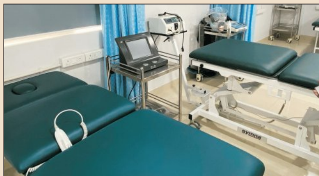
Another view of equipment provided under GG# 19-80213