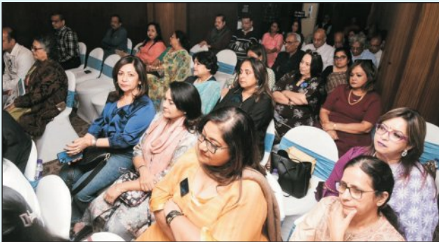
A close view attending Rotarians