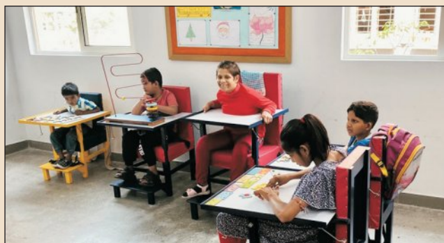
Another view of Cerebral Palsy children