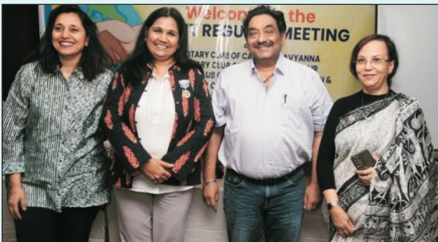
A view of Club Secretaries