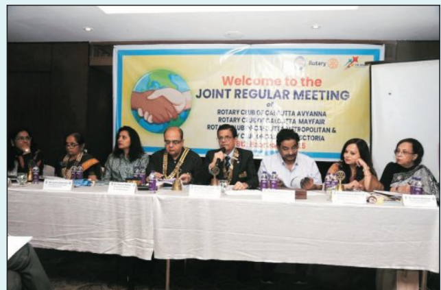
A view of Head table with Four Rotary Club Presidents & Secretaries