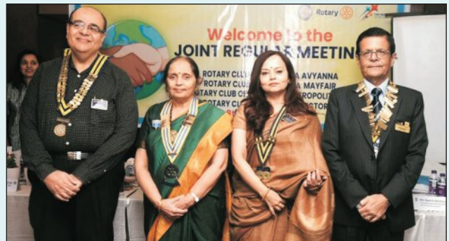
A view of Club Presidents