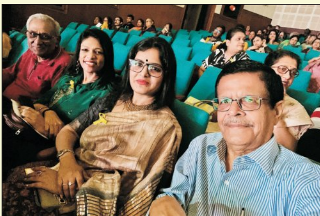
Metropolitans enjoying 5th Annual Fundraiser Concert