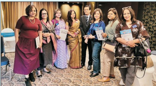
RCCM President with the members of Avyanna