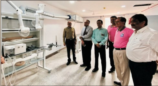
Another view of Artificial Limb section with latest German technology