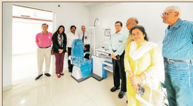
DG was shown where Slit Lamp was provided by the Club under Helping Grant