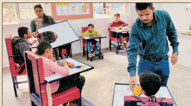
Training to Cerebral Palsy children by teachers