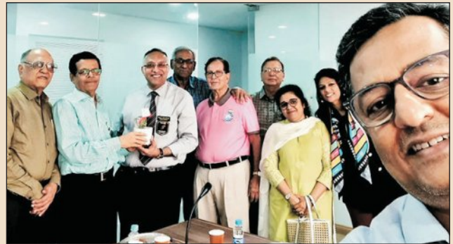
Much needed Selfie