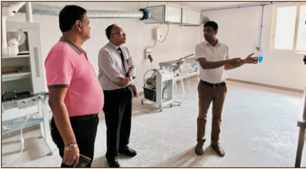
DG visited Artificial Limb block