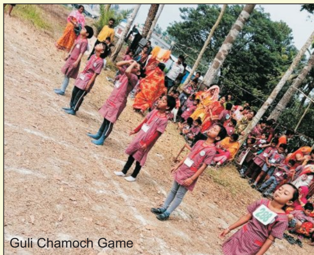
Guli Chamoch Game