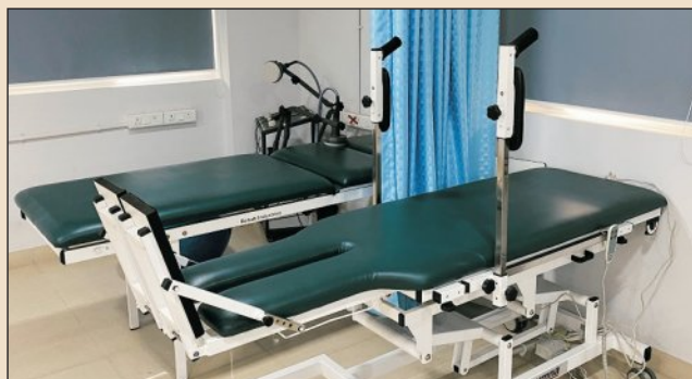
Equipment provided under GG# 19-80213