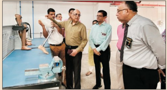
DG was shown latest flexible artificial leg