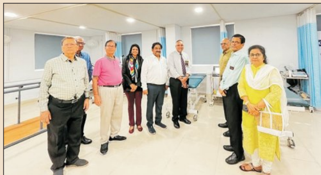
DG with Equipment provided for Cerebral Palsy children