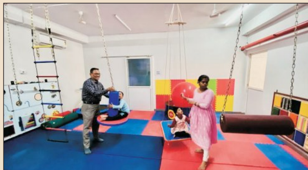
Equipment provided under Global Grant 19-80213