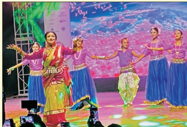
Brand Ambassador Rituparna Sengupta spl Dance performance