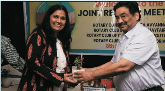
Secretary of Cal Mayfair being felicitated by RCCM Secretary