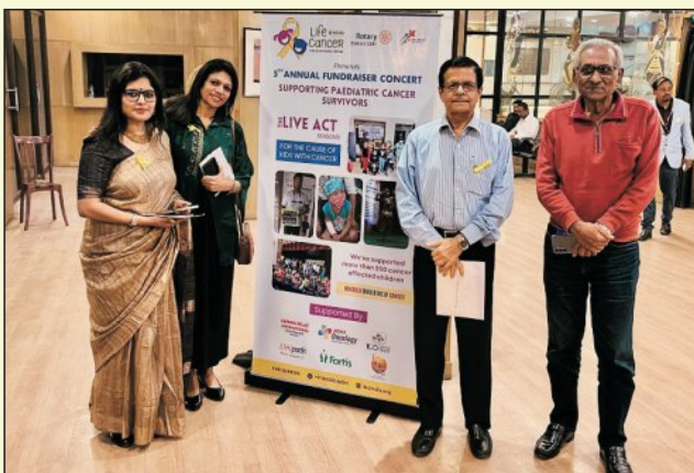
Metropolitans at the Concert