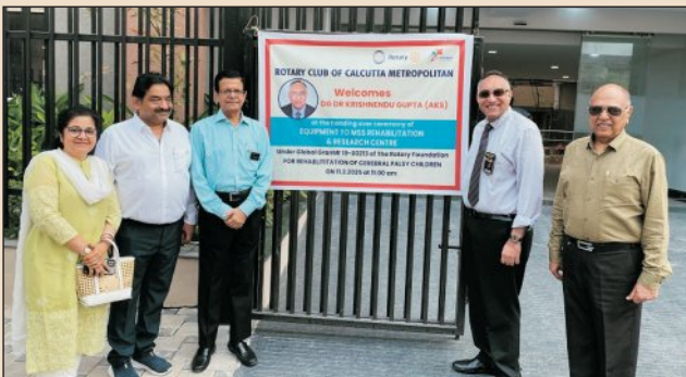
DG with Metropolitans