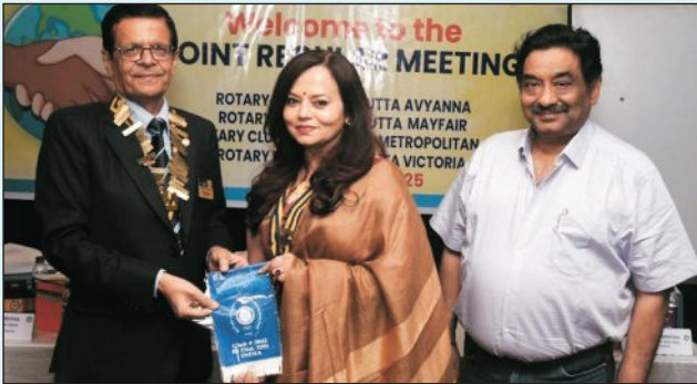
Exchange of Flags by RCCM President with Cal Avyanna President (2)