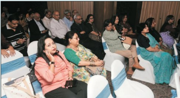
Another view attending Rotarians