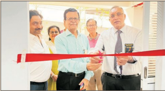
Inauguration of equipment provided in Physiotherapy unit