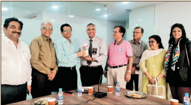
DG is being felicitated