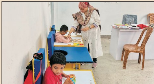
Another view of Cerebral Palsy children