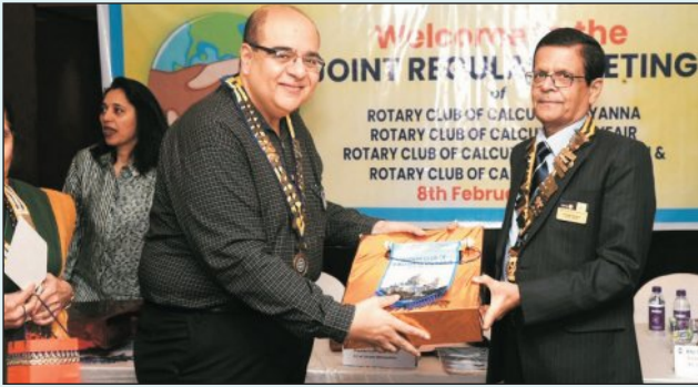
Exchange of Flags by RCCM President with Cal Victoria President