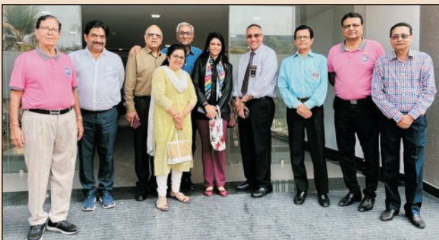
Happy time with DG