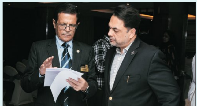
Discussing Nitty Gritty before the start of Joint Regular Meeting