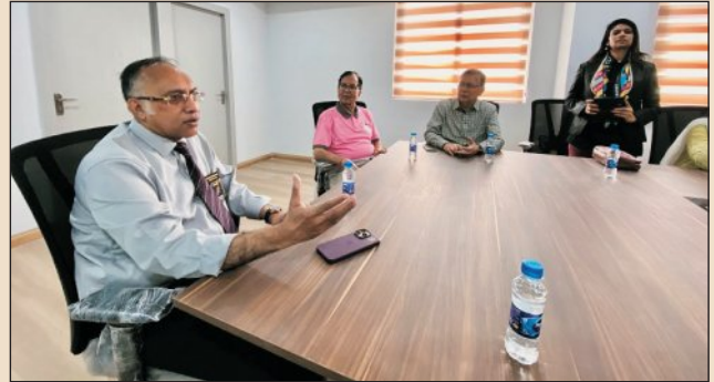
A brief meeting with DG by RCCM & MSS members