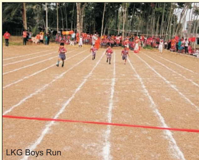
LKG Boys Run

enjoyed the sports. Games were also organized for the Alumni. There was dress up competition for all students. It was a day of full fun and enjoyment.